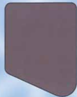
profile of tungsten carbide insert